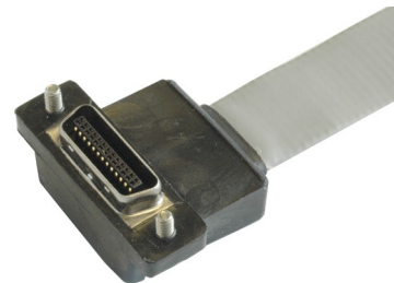
Detail of AS-CBL-CL-ADPU-A-M2

Adapter cable AS-CBL-CL-ADPx-A-M2 can be used to provide a standard Camera Link socket on the system case if there is limited connector depth on the front panel. This comprises a low profile right angle plug that plugs into Phoenix-Dig24CL , 0.2m of special ribbon cable, and a panel mount Camera Link socket. The 'x' in the part number can be 'U' or 'D'. 'U' means that the ribbon cable exits upwards from Phoenix-Dig24CL , 'D' exits downwards.